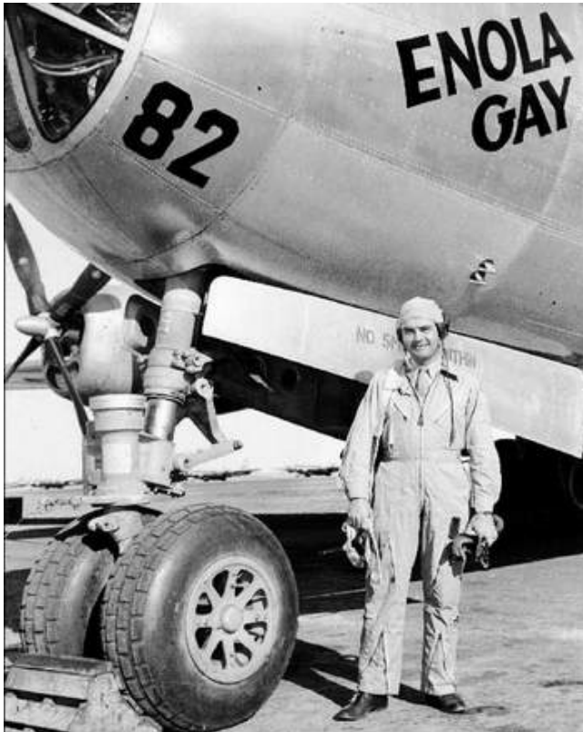
Col. Paul Tibbets stands beside the Enola Gay, a B-29 Superfortress bomber, in 1945 in an unknown location. He piloted the Enola Gay flight that dropped the atomic bomb on Hiroshima.